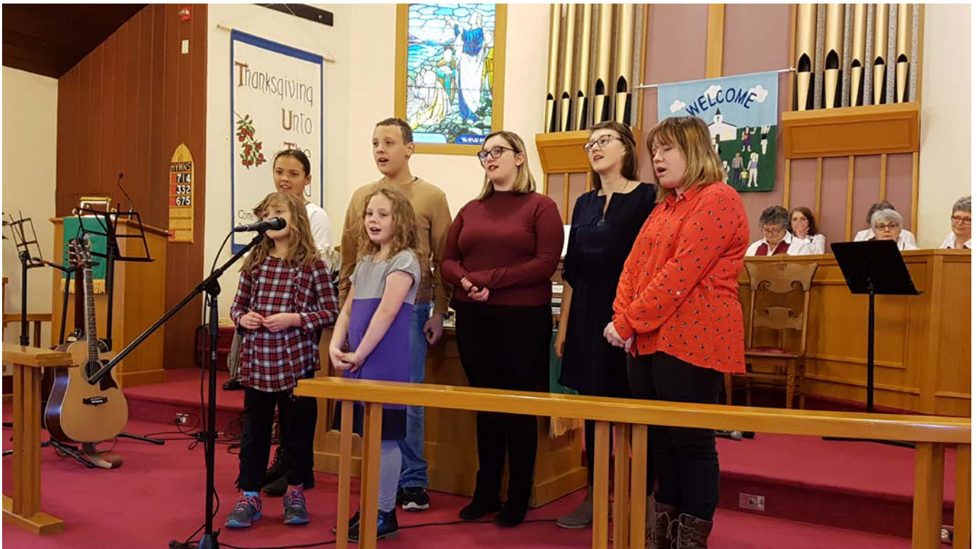
Anniversary Hymn Sing 2019